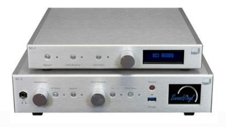
The SweetVinyl SugarCube SC-1 (top) and SC-2 (bottom)

The noise-isolating algorithm is one of SweetVinyl's unique selling points, but modern consumers expect more from their hardware than a single feature. To increase the SugarCube's marketability, it needs a device display, a connected mobile app, and an ability to go online and download additional programs and updates. Additionally, some users may also want to record their music or see information about the album they're listening to.