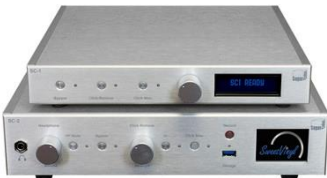
The SweetVinyl SugarCube SC-1 (top) and SC-2 (bottom)

The noise-isolating algorithm is one of SweetVinyl's unique selling points, but modern consumers expect more from their hardware than a single feature. To increase the SugarCube's marketability, it needs a device display, a connected mobile app, and an ability to go online and download additional programs and updates. Additionally, some users may also want to record their music or see information about the album they're listening to.