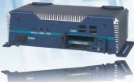
Dimension: 8.35" (W) x 2.53" (H) x 4.21" (D)

BOXER AEC-6820 Fanless Embedded Control PC