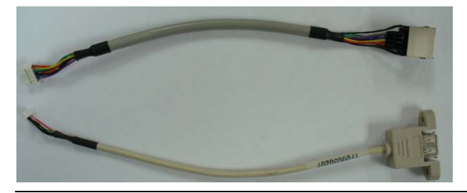
PER-C11L Quick Installation Guide 10