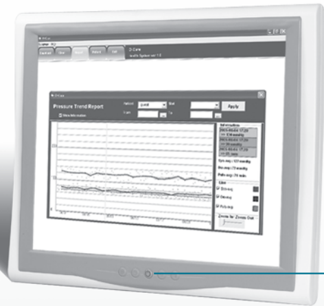
On Screen Display Control Pad