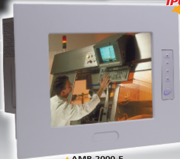
▲ AMB-2000-E 10.4" Fanless Panel PC with Optional Aluminum Bezel