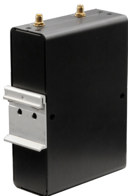
DIN-Rail Mount Illustration