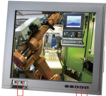
USB x 2 LCD On/Off Brightness + Brightness -

17" Rugged Fanless Touch Panel PC with Intel® Celeron® 827E/ Core™ i7-2610UE Processor, 2 GB RAM