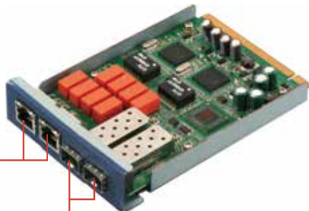
LAN, RJ-45 x 2

Two PCI-Express Gigabit Ethernet & Two SFP Fiber LAN Module